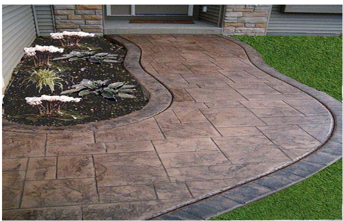
Cem Floor Color- Jointing Flat Texture Color