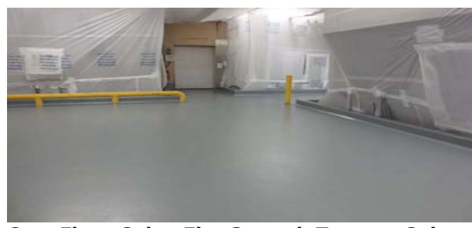
Cem Floor Color-Flat Smooth Texture Color