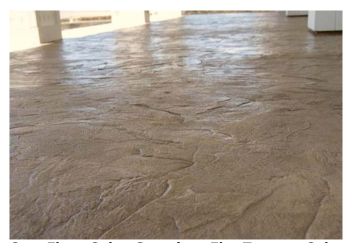
Cem Floor Color-Seamless Flat Texture Color