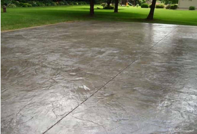
Cem Floor Color-Seamless Flat Texture Color

Medium Duty Floor Approximately 4.00 kg/m<sup>2</sup> Heavy Duty Floor Approximately 6.00 kg/m<sup>2</sup>