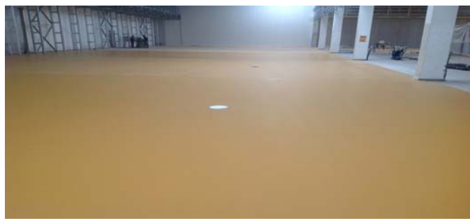
Cem Floor Color-Flat Smooth Texture Color