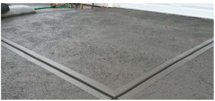
Wet Applied Method, Expansion Joint