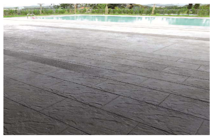
Cem Floor Color-Jointing Flat Texture Color